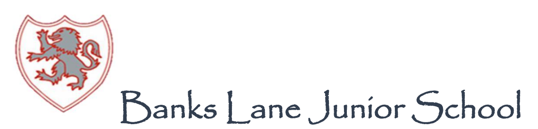
Communication, Collaboration, Curiosity, Resilience, Reflection

At Banks Lane Junior School we aim to support every child to succeed both academically and personally. We actively promote our "believe to achieve" motto in the hope that all our children will develop and maintain a positive self-image and be motivated to try their best.