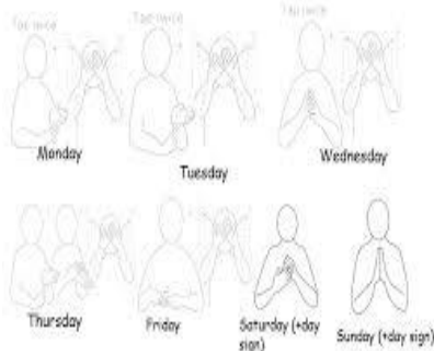
Days of the Week

Our children have been learning the Makaton days of the week. Today's word of the day is Friday.